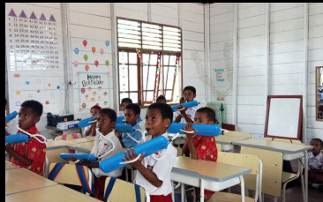
Kindergarten and Elementary Teaching and Learning Activities