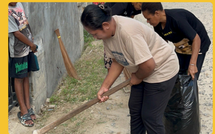
Community Service to Clean the Environment by Parents