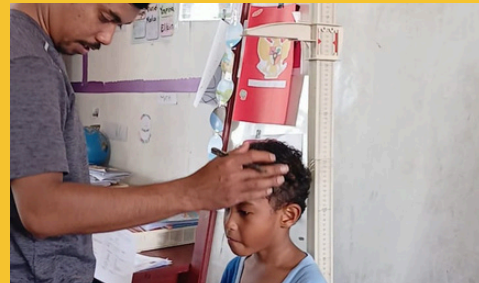
Health Check by UKS Team