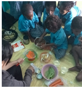
Kindergarten Teaching and Learning Activities